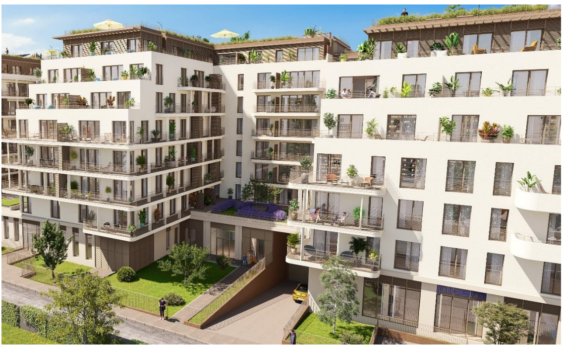
Les Ateliers de Poissy, France (Poissy)

Interconstruction sold to PRIMONIAL in Poissy close to Paris a major project let to Compose the coliving operator and a senior housing development to COVEA NATIXIS. In addition, the subsidiary achieved its goal of selling 485 residential units in the Parisian region, partially as block sales to institutional investors such as Caisse des Dépôts et Consignations and partially to private buyers as unit sales.