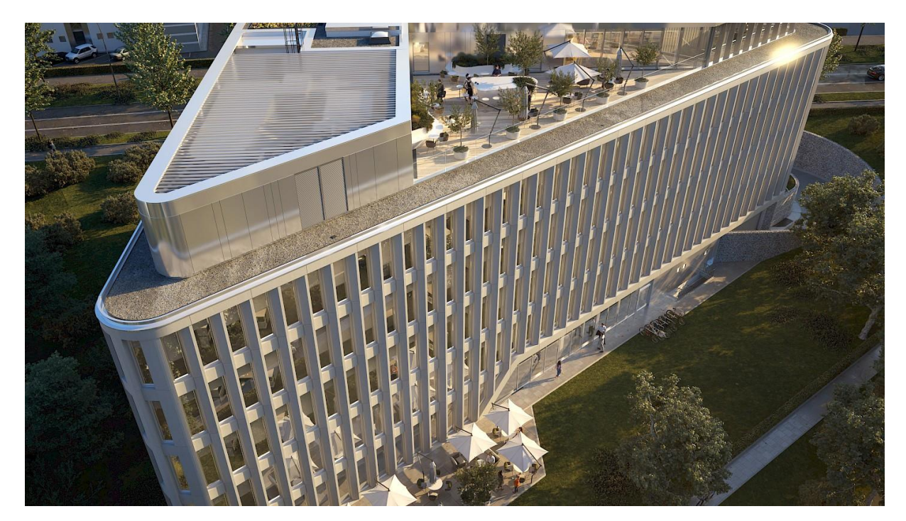
Prism, Luxembourg (Cloche d'Or)