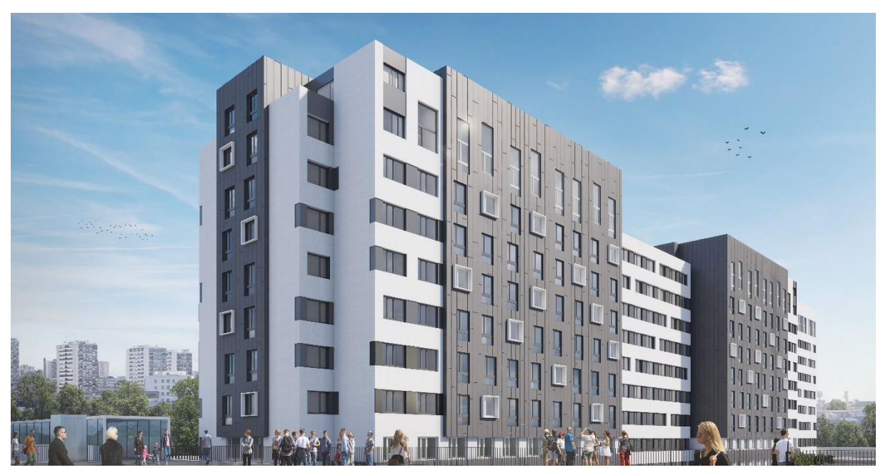
Good Morning Campus , France (Creteil)

Cardinal Promotion sold one of its projects of 570 student housing units in Creteil to individual investors for more than EUR 82 million. Cardinal Gestion , which is the 4th largest student accommodation operator generates recurring revenues for the group through the management of its 45 student housing residences, achieving an EBITDA of 7 million in 2023.