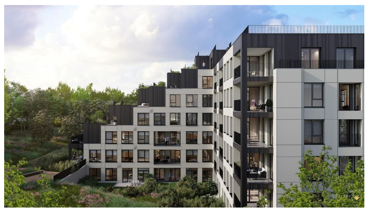
Twin Fall, Belgium (Brussels)

This year, Eaglestone completed several significant transactions, such as the block sale of the co-living part of the Twin Falls project by Eaglestone Belgium for EUR 34 million to ION Residential Platforms (a joint venture between ION, Bouwinvest and CBRE IM). In a challenging market, Eaglestone Belgium also successfully sold off-plan to private buyers for EUR 20 million in the project The W (Brussels) and EUR 11 million in the WoW project (Walloon Brabant). Eaglestone Luxembourg completed the leasing of a strategic site at La Cloche d'Or which will provide 5.000 m² of office space in a project of exceptional architectural quality and certified BREEAM Excellent.